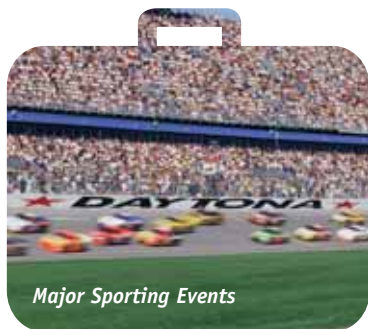
Major Sporting Events