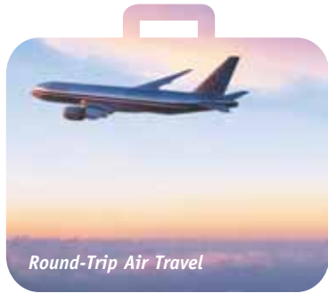
Round-Trip Air Travel